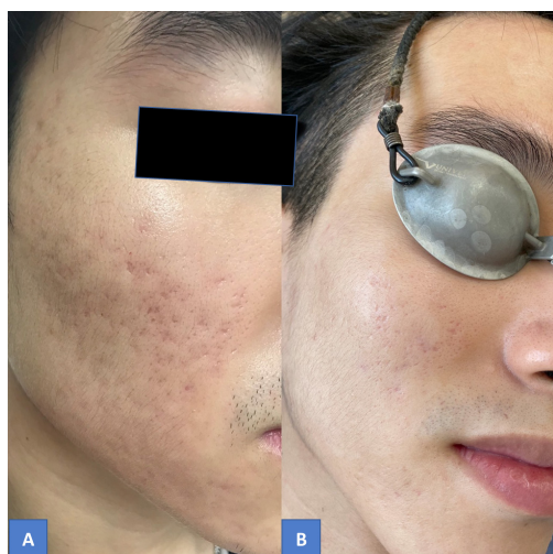
Figure 2. Before (A) and 3 months after treatments (B)