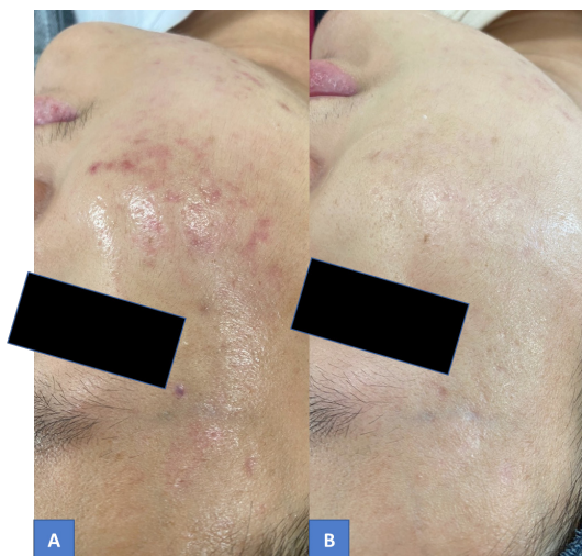
Figure 1. Before (A) and 3 months after treatments (B)