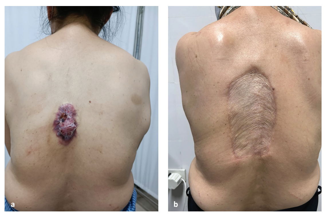
Figure 1. Our case of DFSP before operation (1a) and 1 year after operation (1b)

A biopsy was conducted to obtain a sample for histopathology and immunohistochemistry tests. Hematoxylin & eosin stains revealed dense spindle cells infiltrating the dermal layer in a storiform pattern. The spindle cells exhibited coarse basophilic nuclei, increased mitotic activity, and atypical mitosis. Immunohistochemistry stains indicated CD34 negativity and Ki67 positivity exceeding 30% (Figure 2). Both the histopathology and immunohistochemistry tests confirmed the presence of dermatofibrosarcoma protuberans (DFSP). An ultrasound was ordered to evaluate the depth of the tumor, revealing an indefinite border and a heterogeneous cutaneous tumor. Measuring the size of the tumor was challenging.